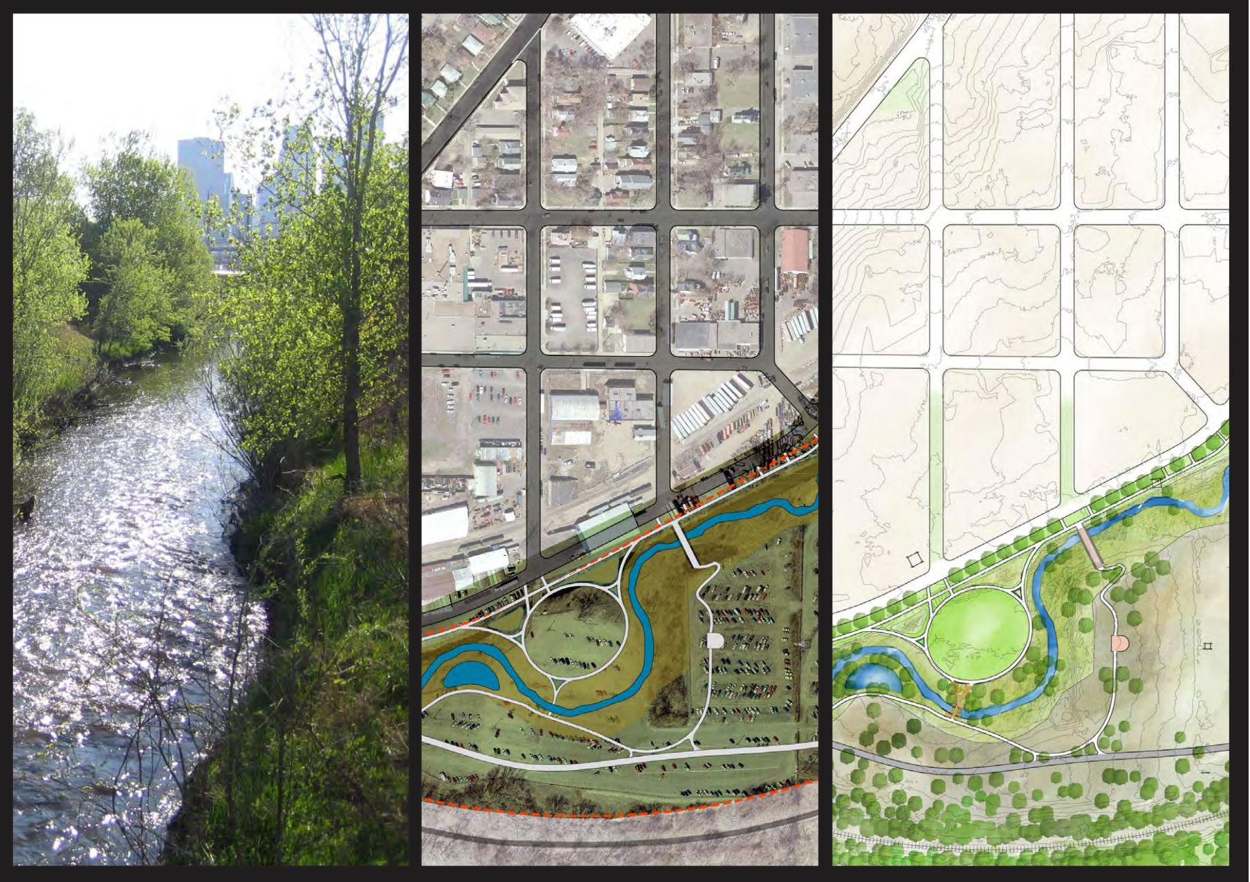
Bassett Creek Stream and Habitat Restoration Implementation Plan