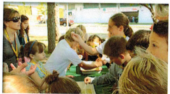
2013 Metropolitan Mosquito District learning station

*Sponsors are recognized at the festival, in the festival booklet, on www.metrocwr.org , and through press releases and articles about the festival. We can also provide the CWF logo to you to put on your website or documents showing sponsorship.