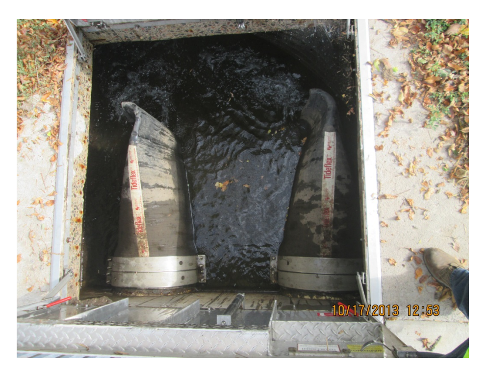
Rubber check valves installed inside new outlet structure, October 2013