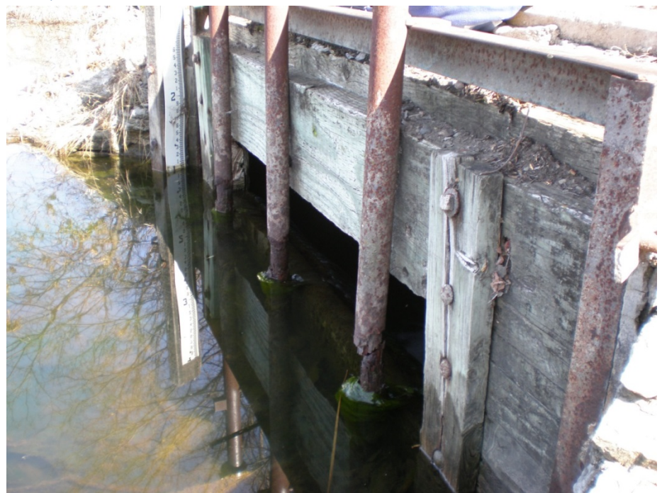
Old Wirth Lake Outlet, March 2012.