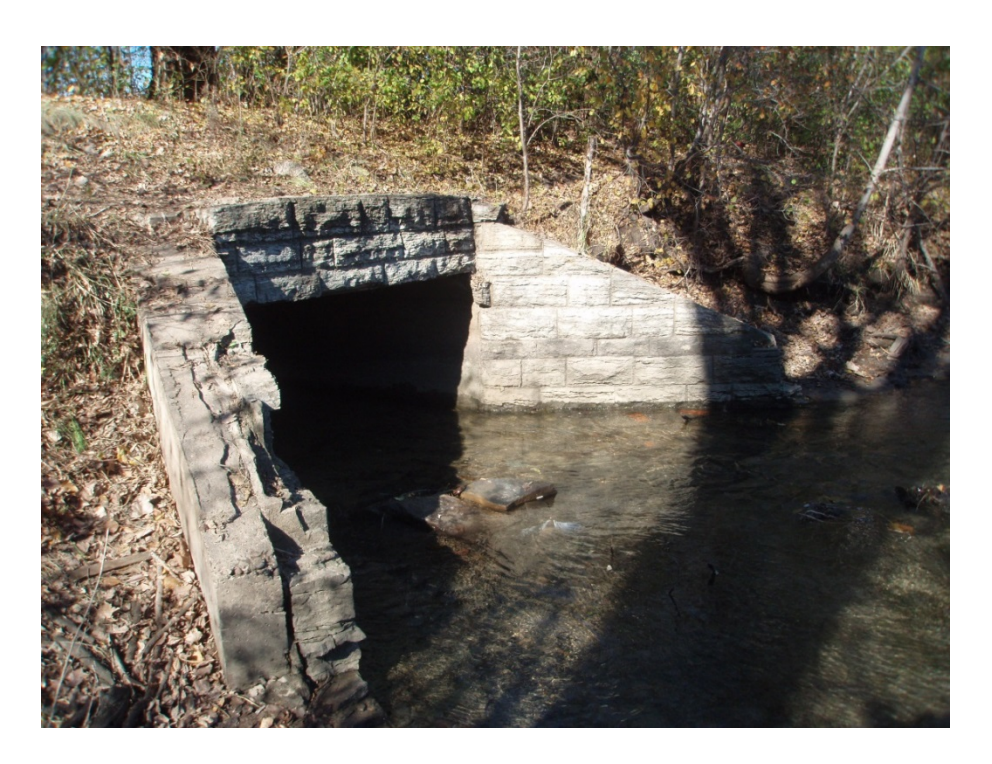
Old Wirth Lake Outlet, March 2012.