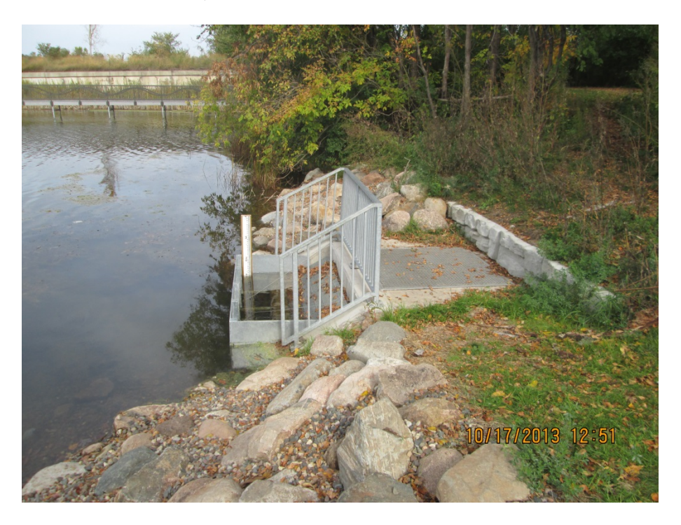
New Wirth Lake Outlet with skimmer, October 2013