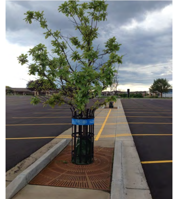
Tree trenches at Maplewood Mall

A model MIDS ordinance package that will help developers and communities implement MIDS.