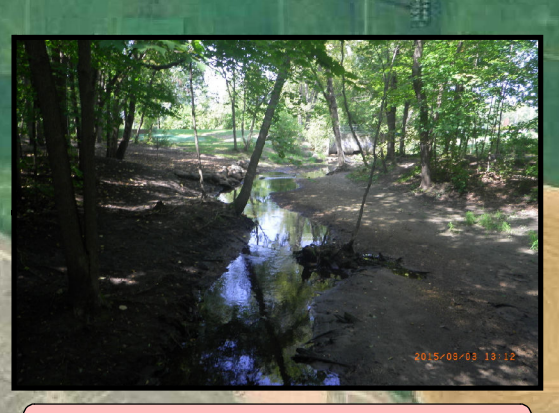
Alt 1: Re-meander into historic channels in upper third of reach