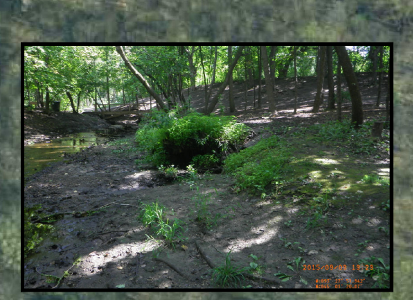
Alt 3: Install fencing and shade tolerant vegetation to establish vegetative buffer on creek banks