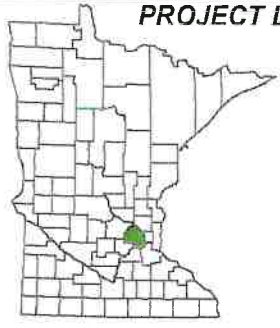
Hennepin County State of Minnesota

SOURCE: MN DNR, USDA, ESRI, TIGER, Bing, Hennepin Co., Anderson Engineering