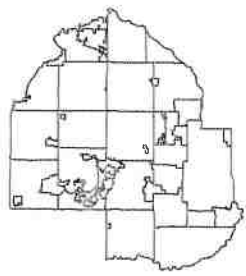
City of Plymouth Hennepin County, MN