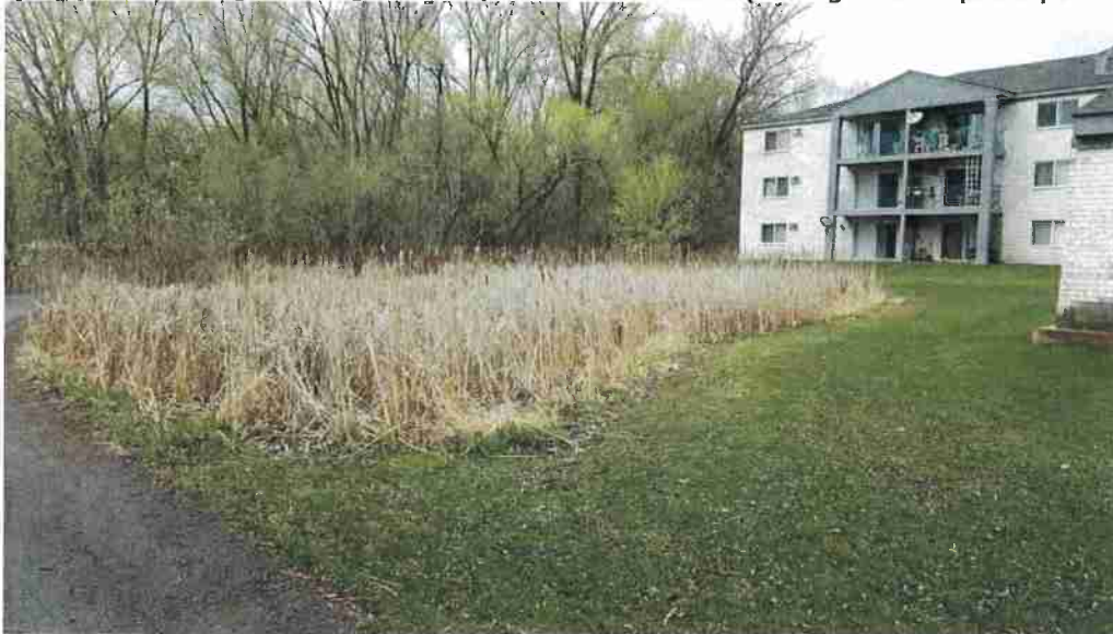
Wetland 3: Looking W along boundary from Photo Point 1 (see Figure 5 for photo point locations)