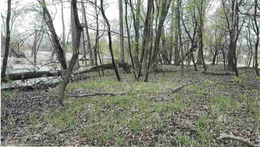
Wetland 1: Looking SW from Photo Point 1 along boundary (see Figure 5 for photo point locations)

The wetland boundary was delineated based on changes in topography (fill areas) and probing the soil to evaluate hydrology. In some areas near the sidewalk, the wetland boundary was based on the edge of pavement.