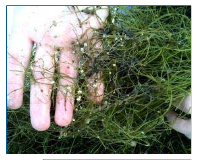
Starry stonewort, pictured above, is an invasive green alga. Star-shaped structures called "bulbils" allow it to reproduce vegetatively.

are all male, although there may be undiscovered females. This means that starry stonewort reproduction in the United States is vegetative and the spread of starry stonewort is probably through human movement of fragments from lake to lake. In particular, starry stonewort produces small, starshaped structures called "bulbils" that allow it to reproduce