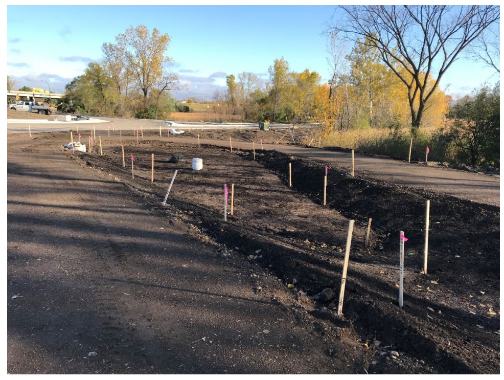
North Rain Garden – North View