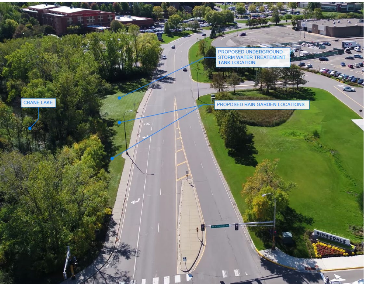
Preconstruction - Drone South View of Ridgedale Drive & Crane Lake Park