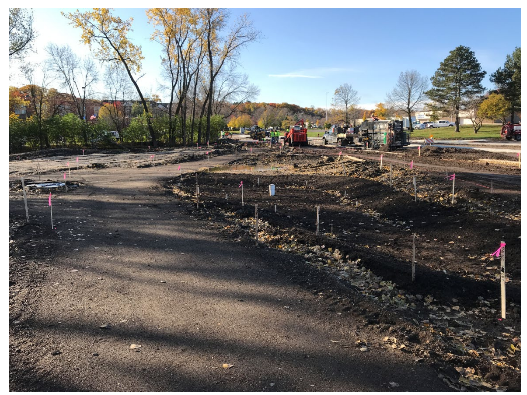
South Rain Garden – South View