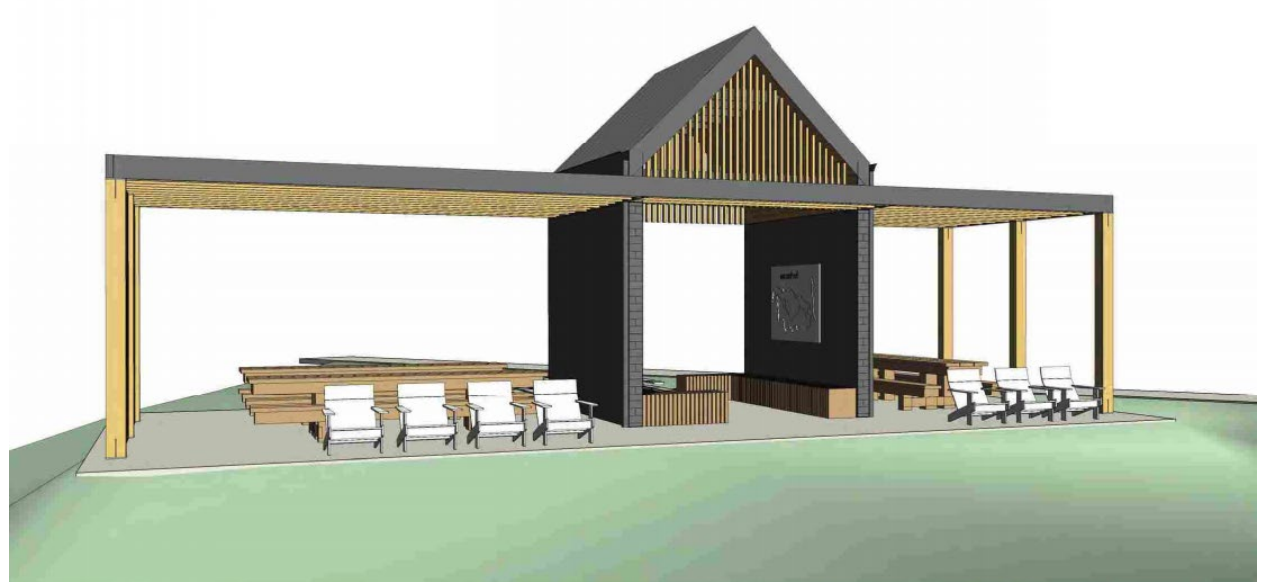
Graphic Depiction of Future Shelter with Educational Kiosk at Crane Lake Park