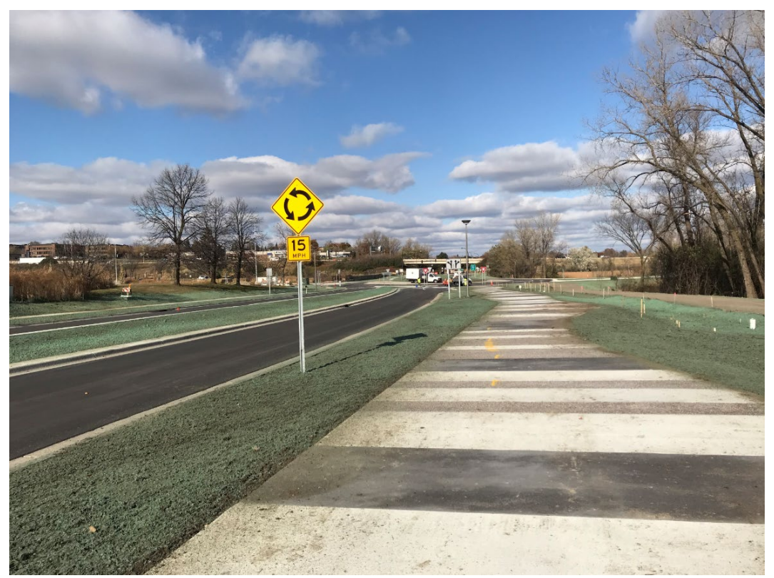
Temporary Seeding – North View