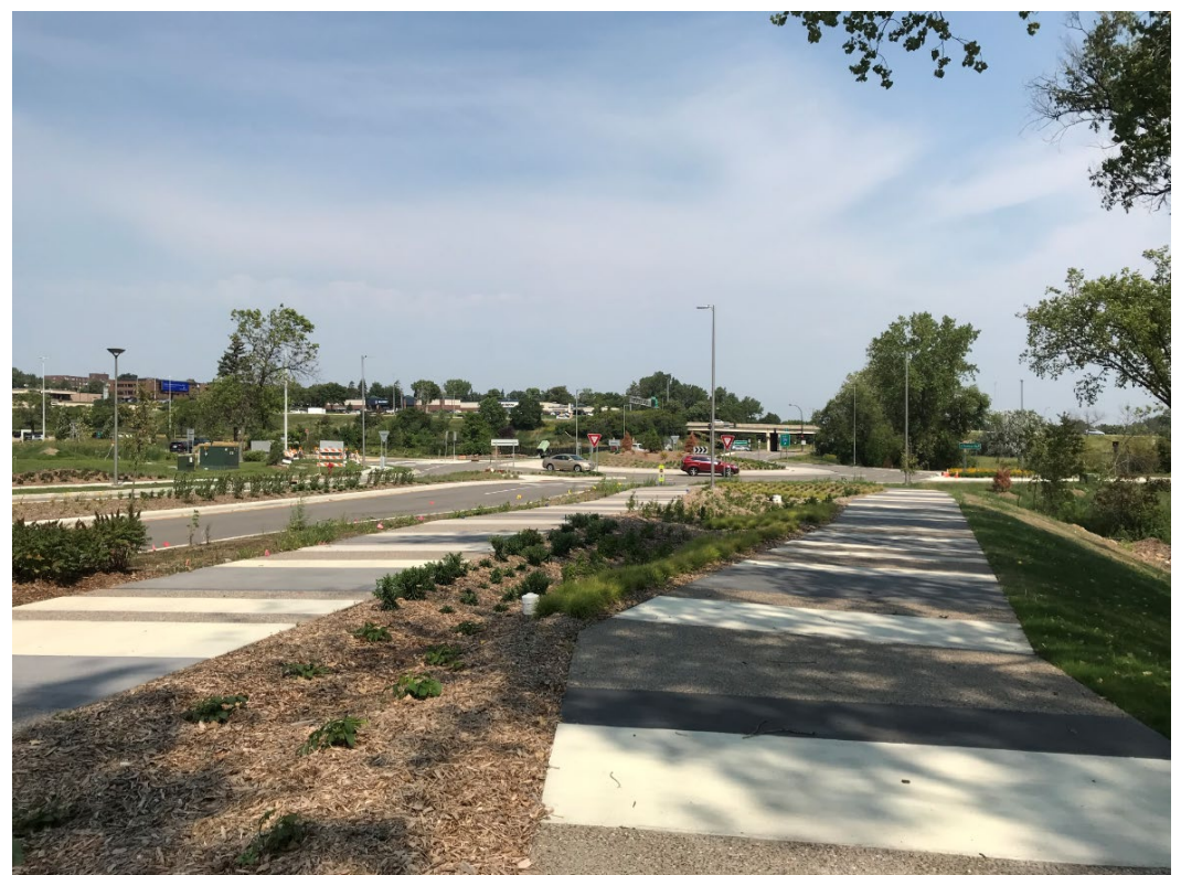
South Rain Garden Plantings Installed – North View