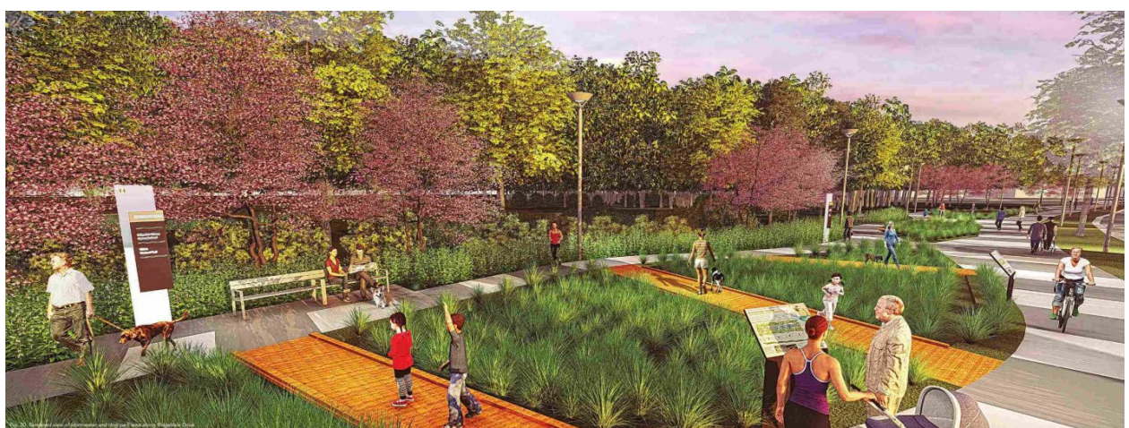
Graphic Depiction of Rain Garden Areas at Crane Lake Park