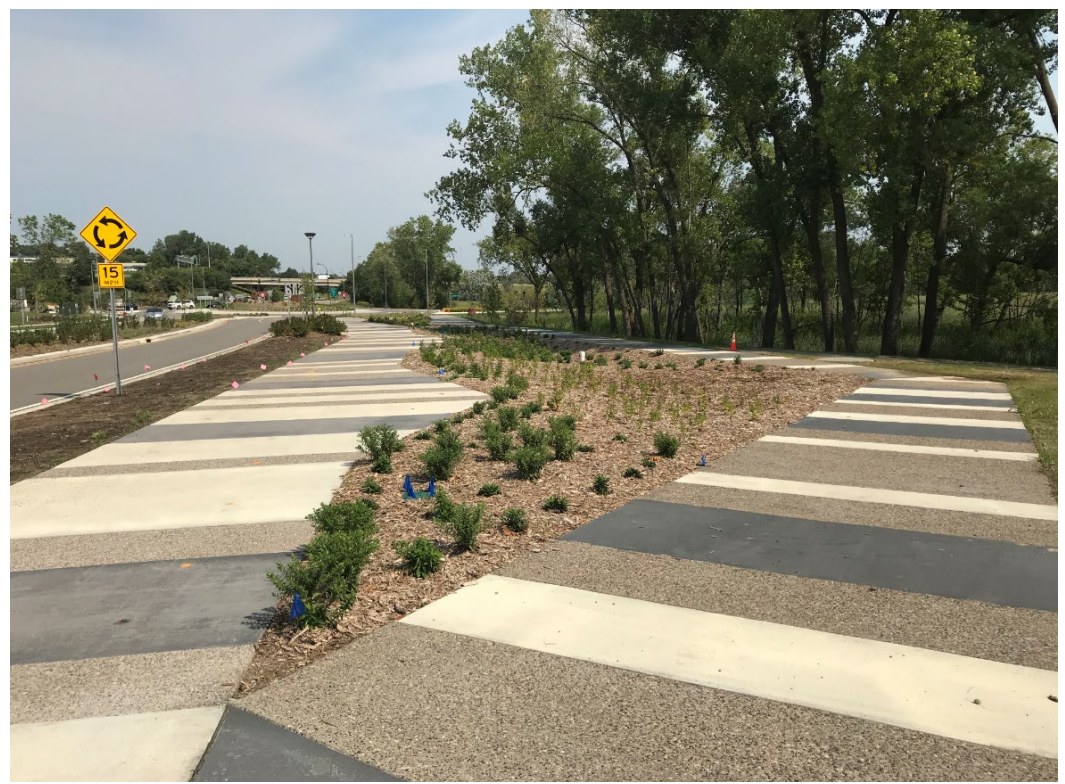
North Rain Garden Plantings Installed – North View