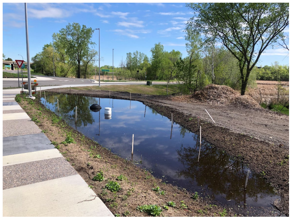
North Rain Garden (Valve Closed – Filtration Needed) – North View