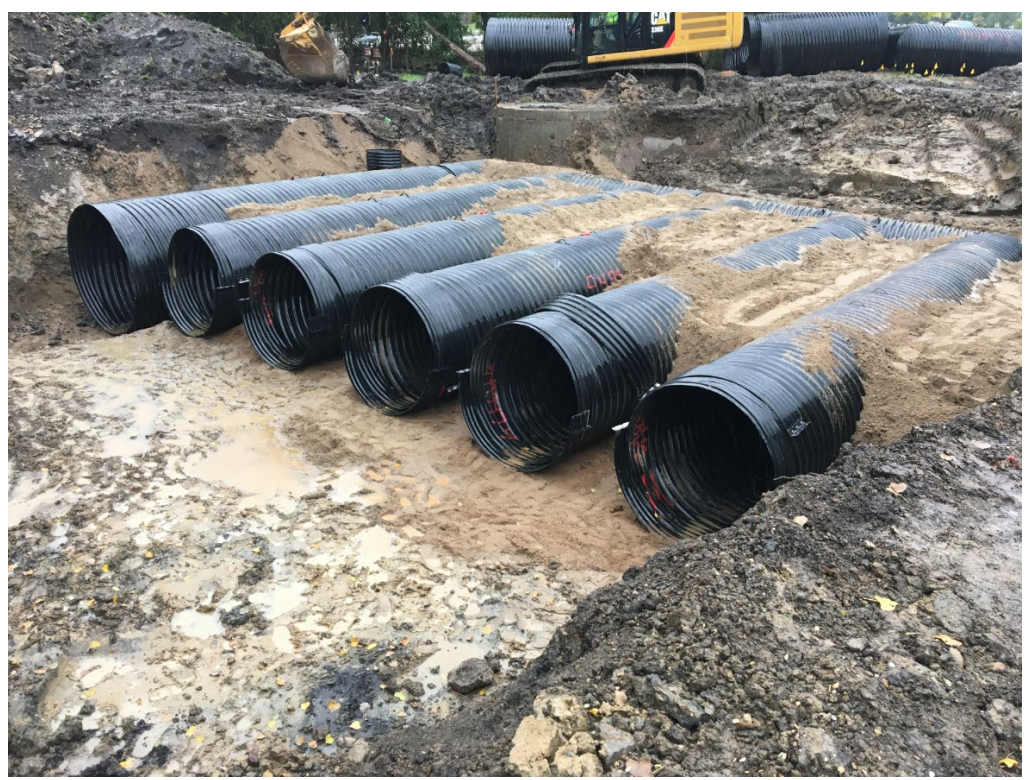
Underground Storm Water Tank Construction at Crane Lake Park – South View