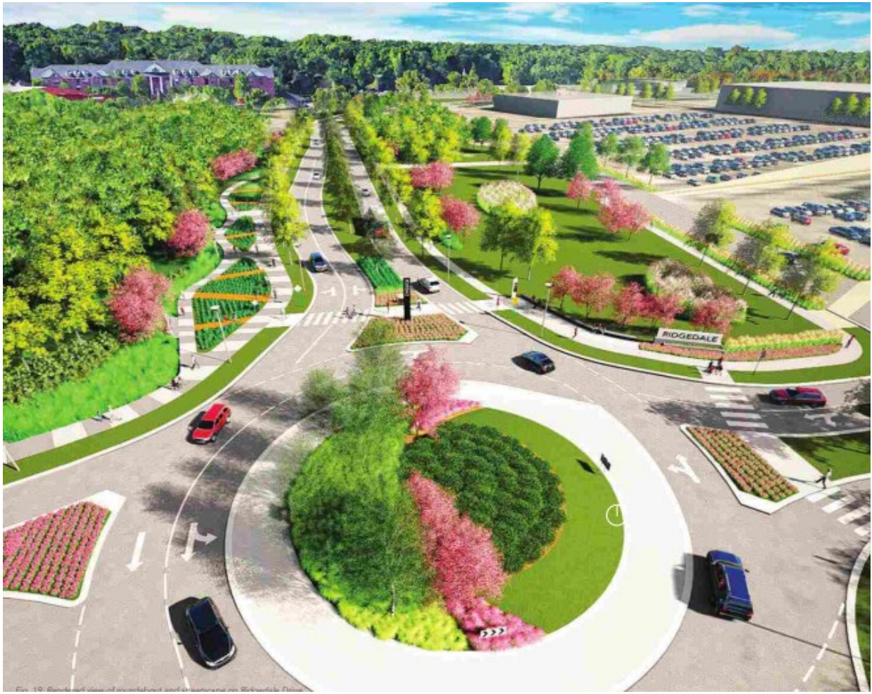
Graphic Depiction of Ridgedale Drive Near Crane Lake Park – South View