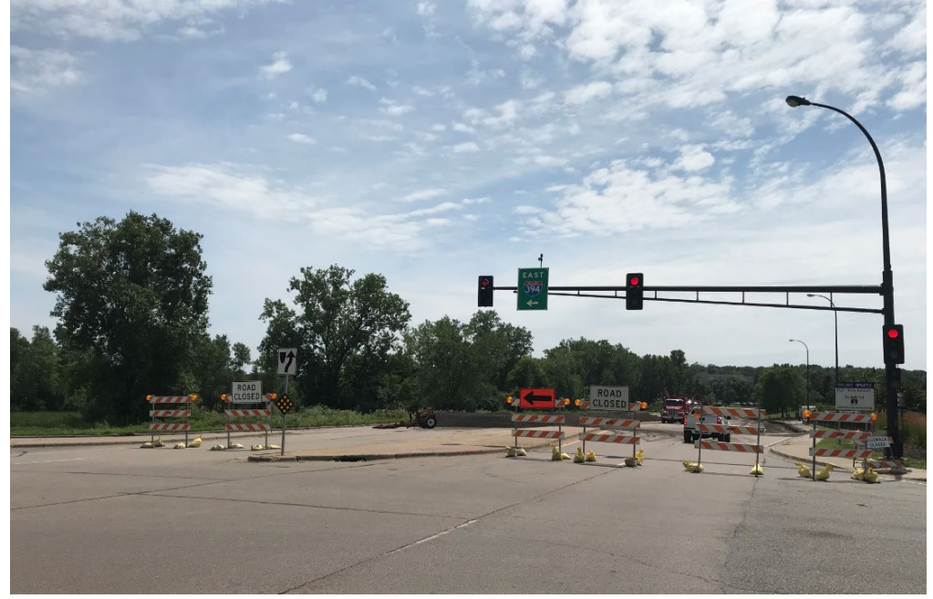
Construction Starting - South View of Ridgedale Drive & Crane Lake Park