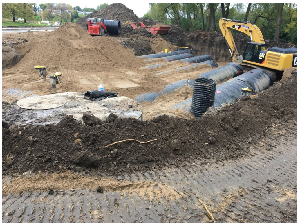
Underground Storm Water Tank Construction at Crane Lake Park – North View