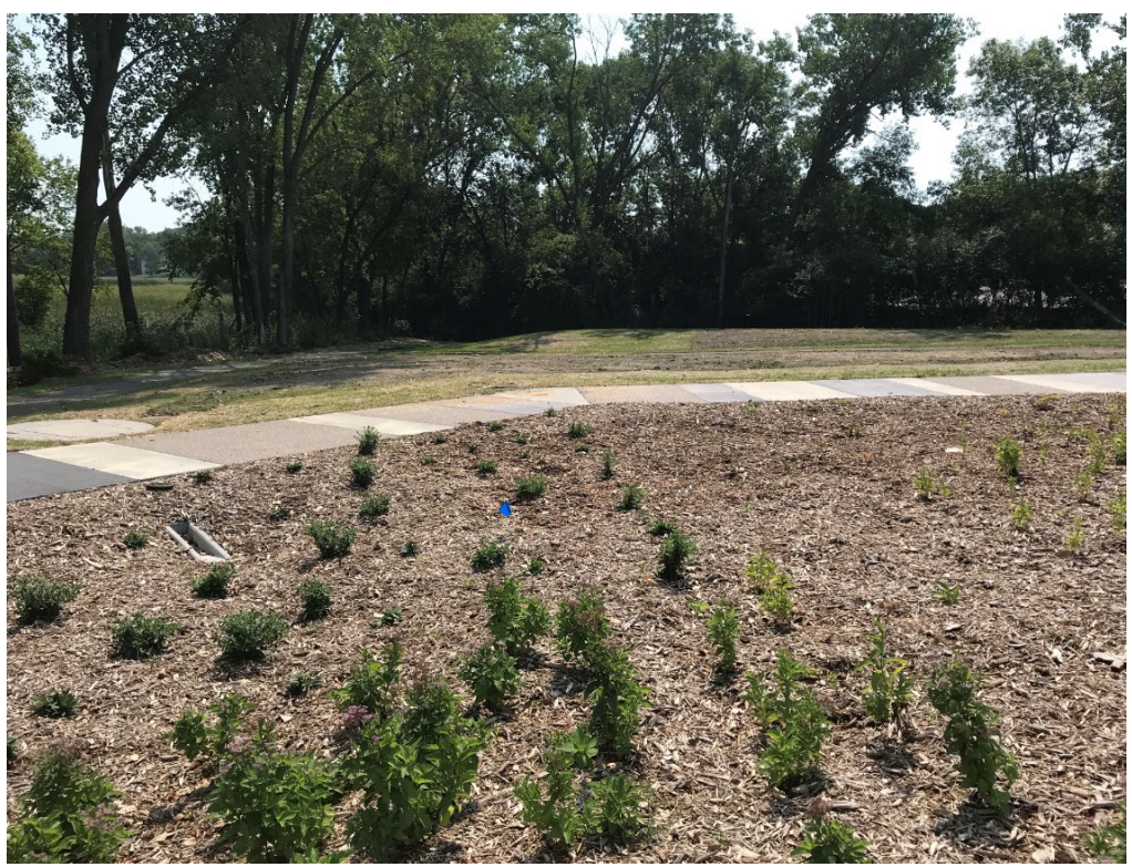
North Rain Garden Plantings Installed (Lift Station Outlet Left Side of Photo) – SE View