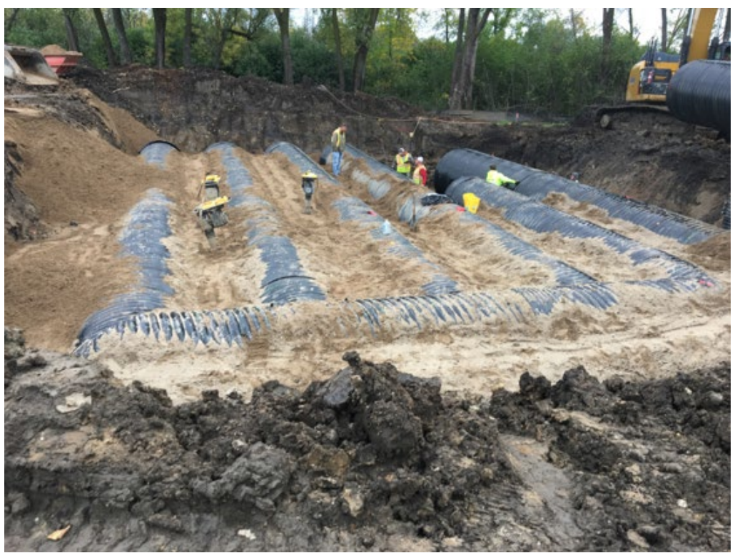
Underground Storm Water Tank Construction at Crane Lake Park – East View