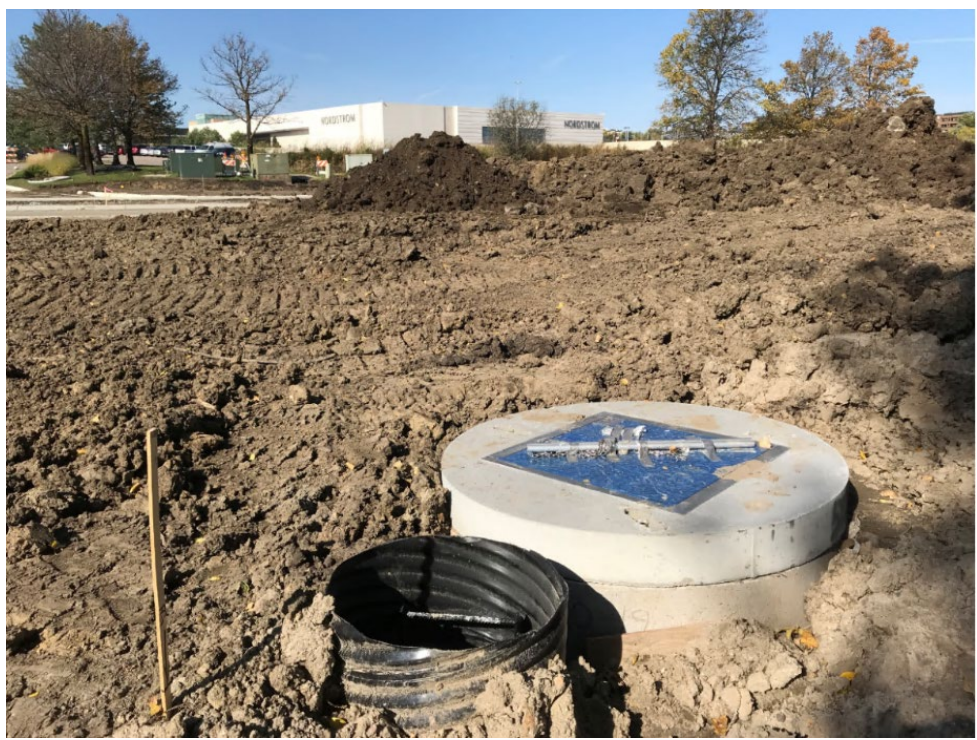
Storm Water Lift Station Access Structures at Crane Lake Park – West View