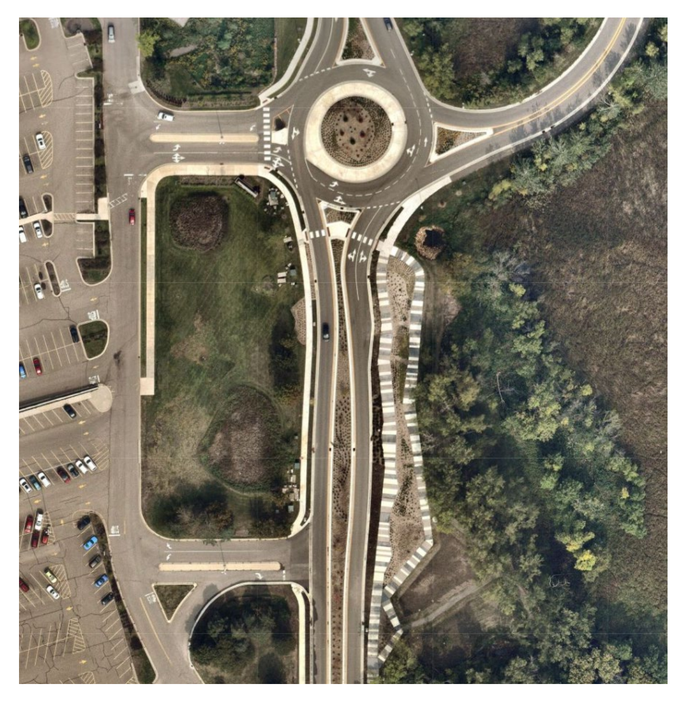
Aerial of Crane Lake Park Area – September 2020