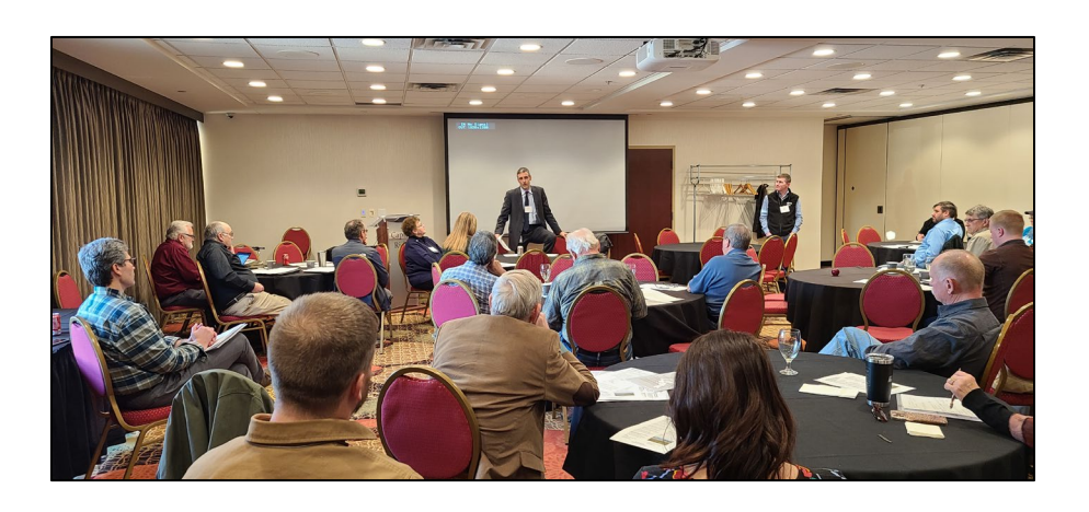
2023 Legislative Briefing