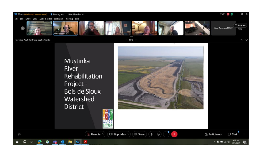
Clean Water Council Meetings