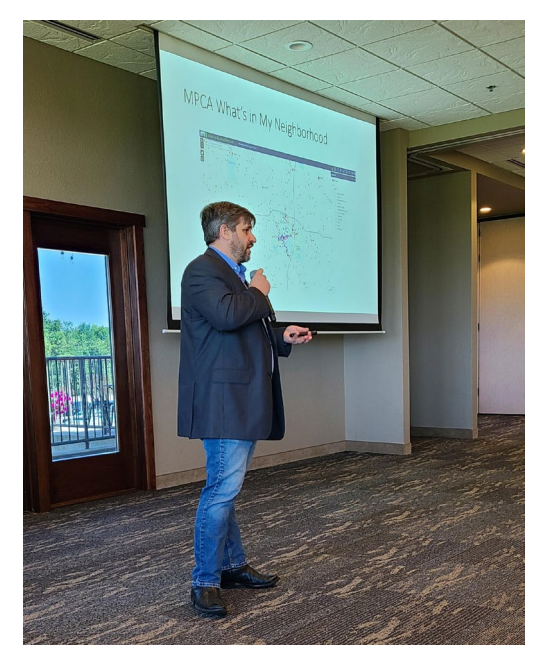
Summer Tour Education Workshop

Watershed Management Workshop at the 2023 Annual Conference