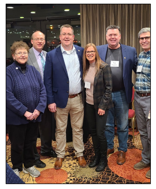
Legislative Briefing and Day at the Capitol

ESTABLISH A COMMUNITY THAT SUPPORTS ONE ANOTHER